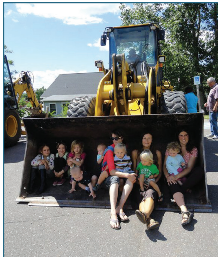
Moms and story hour children pose for a photo inside the big shovel of one of the heavy operation maintenance trucks belonging to the City of Bayfield. Workers stopped by, for a "Meet the Big Machinery" story hour in June, as part of the Summer Reading Program "Build a Better World".